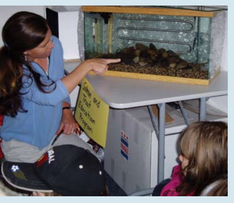
THE STEP PROGRAM INCLUDES HATCHING STEELHEAD EGGS IN THE CLASSROOM

Understanding watersheds is key to their protection, and many local schools are teaching the next generation about their importance. The Resource Conservation District of Santa Cruz County has produced a watershed curriculum called Watershed Cruzin, the San Lorenzo Valley High School has a watershed academy program, and the Monterey Bay Salmon and Trout Project supports the Salmon and Trout Education Program (STEP).